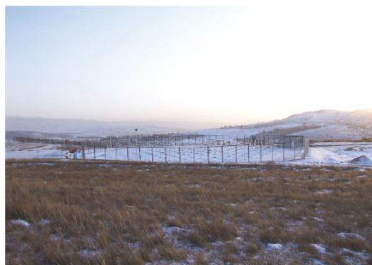
20km stratospheric wind profiler radar